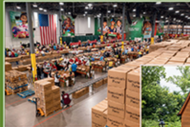
Samaritan's Purse Operations Center