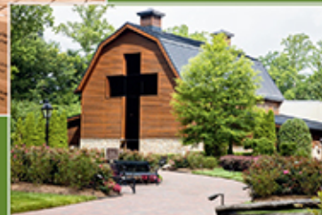
The Billy Graham Library